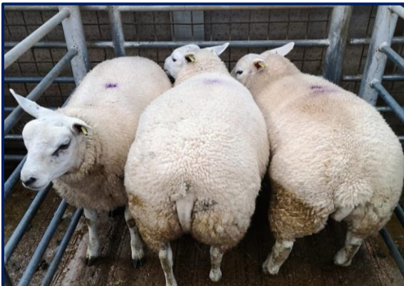
43.0kg 226p/kg S Moss

Generally lambs regardless of weight traded around £2 per/kg. Only the very best realising over 210p/kg and the plain lambs under 190p/kg.