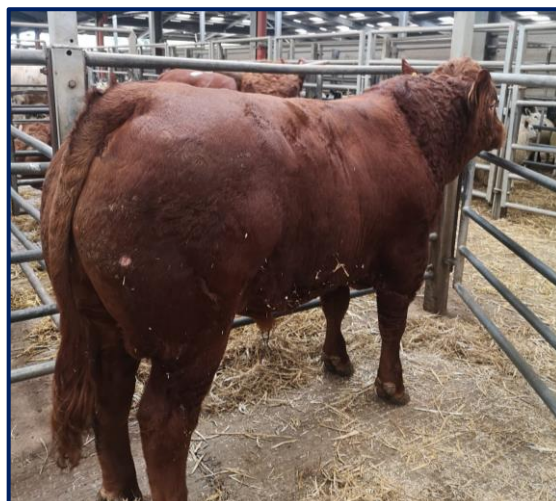
NJ PA & RA Lloyd, 236p/kg 550kg, 15m LIMx